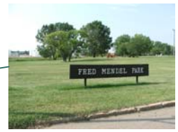
Fred Mendel Park