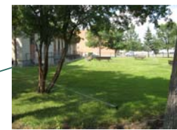
Steve Patola Park