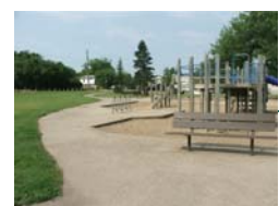
Pleasant Hill Park