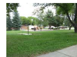
D.L. Hamilton Park